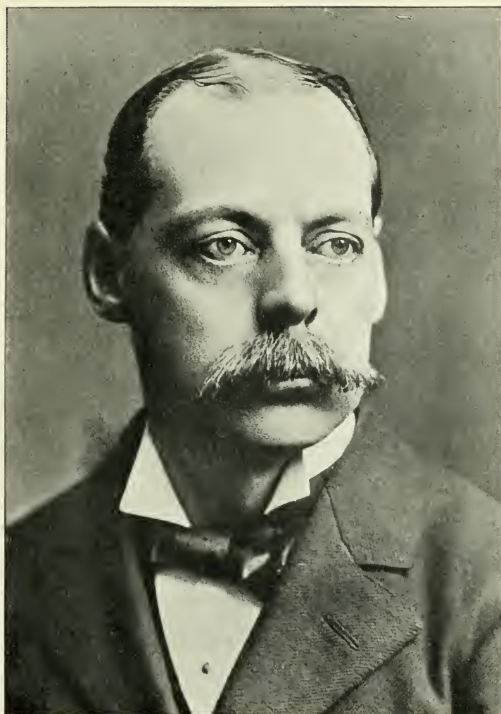
LORD RANDOLPH CHURCHILL, 1885.